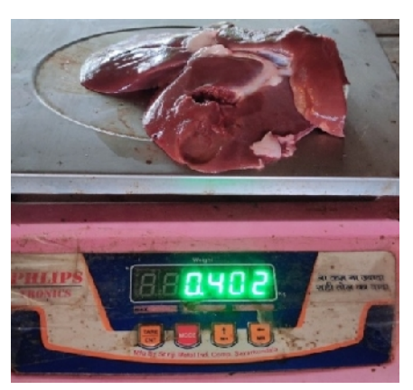
Fig. 1. Measuring the weight of liver.

Width: Separate width of each lobe of liver in both males and females were calculated and found that average width of left lobewas found to be 3.48 inches. The width of right lobe was found to be 3.47 inches. The width of quadrate lobe was found to be 2.34 inches. Thickness: The thickness of each lobe of the liver was recorded in all the animals and results were like thickness of left lobe was 1.65. Thickness of right lobe was 1.53 inches while thickness of quadrate lobe was found to be 0.73 inches.