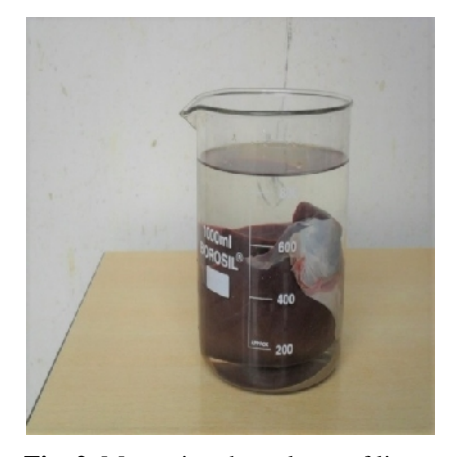
Fig. 2. Measuring the volume of liver.

Similar types of ligaments were found by Sethi et al. (2021) in Bakerwali goat and non-descript goat, (Dyce et al. , 2002) in domestic animals, (Konig and Liebich 2006) in goats, while (Siddig, 2002) in Camel and (Bamaniya et al. , 2016) in Marwari goats noticed presence of seven ligaments.